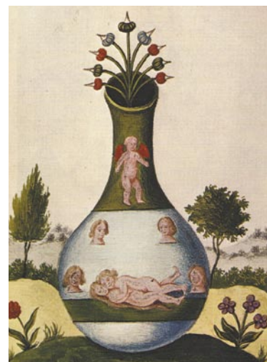
The Western version of white tantra, symbolised in the alchemical union of the male and female to create the soul in the Hermetic vessel (transmuted sexual energy).