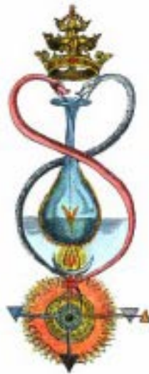
Alchemical depiction of these two latent forces within the human being.