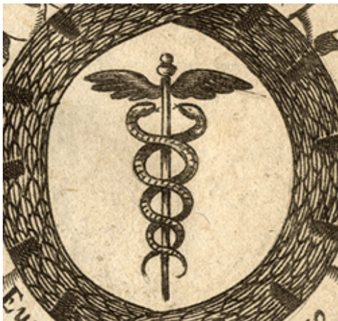
The Caduceus of Mercury. The staff is the spinal column and the two serpents symbolise the two channels or nadis called in the East Ida and Pingala.