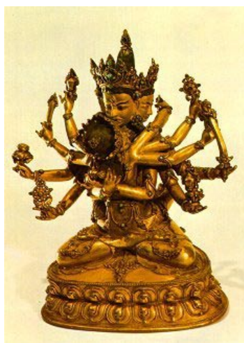
Tibetan depiction of the sexual union of the masculine and feminine principles; ying and yang, ida and pingala, sun and moon, fire and water. This is also known as sexual yoga or white tantra.