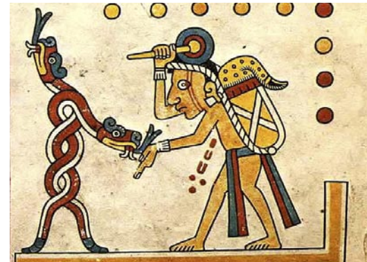
From an Aztec Codex, depicting the warrior or initiate being nourished by the two serpents, symbolising the two secret forces within oneself.